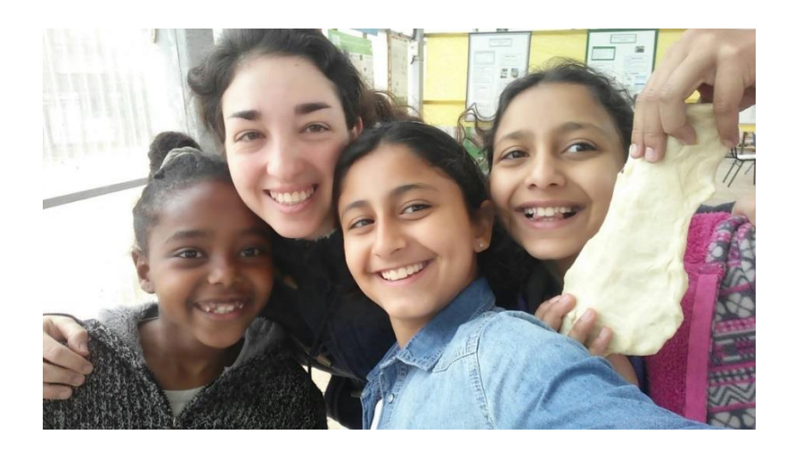
Thank you Teamup for your generosity in helping Negba take a huge step forward in serving Children and Youth At-Risk!

The Negba Teamup Calendar kept the children's families in touch, too. With restricted access, parents of Negba's children remained informed about special events and activities, and holiday dates when Negba was not in session. Instances of children stranded outside a closed Negba club were greatly reduced.